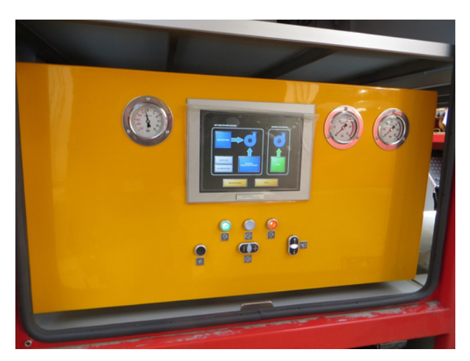
Pump operation according to your wishes