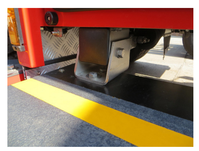
Stainless steel hinges