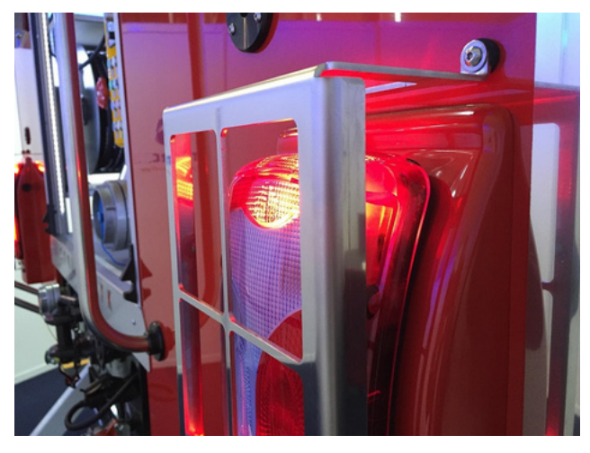
Rear fuse protection