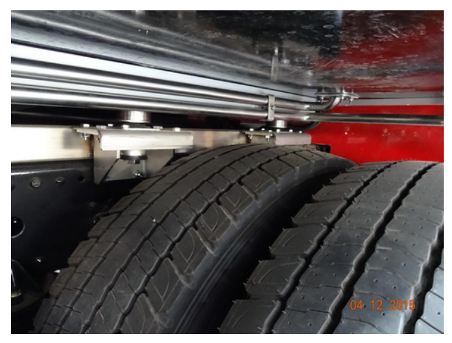
Stainless steel subframe, stainless steel water pipe