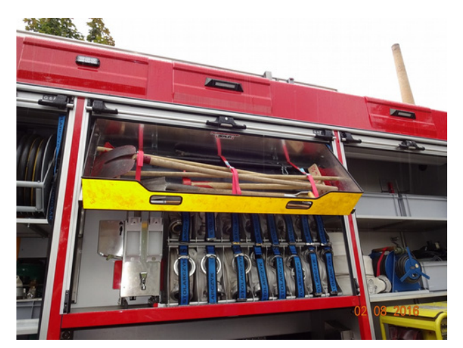
Tiltable drawers to suit your needs