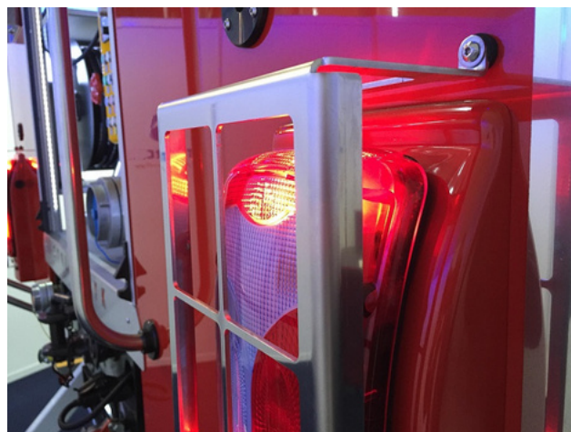
Rear fuse protection