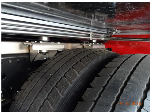
Stainless steel subframe, stainless steel water pipe