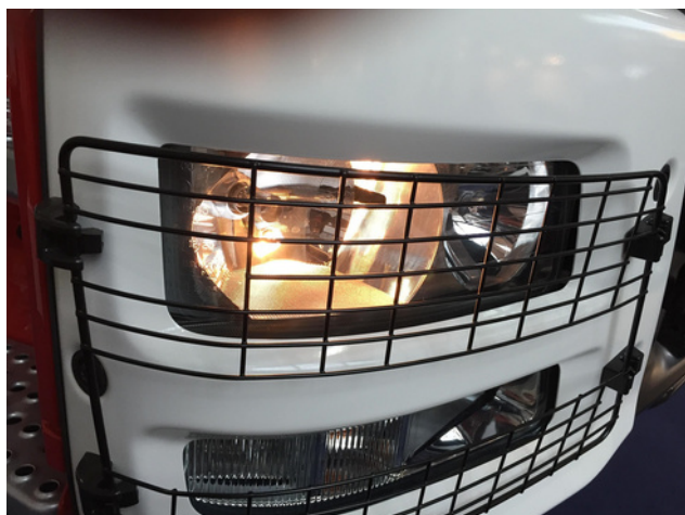
Front lighting fuse