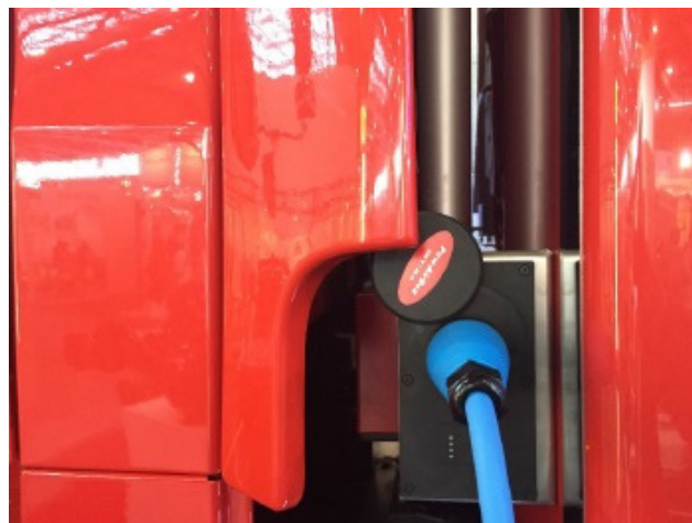
Latest charging technology