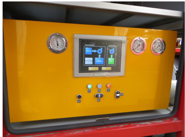
Pump operation according to your wishes