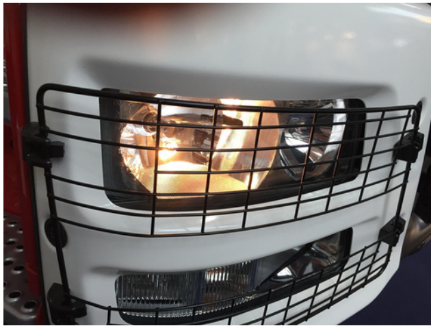
Fuse for front lighting

Feuerwehrtechnik Berlin Tabbertstraße 12 A 12459 Berlin Tel. 030-530 177 56