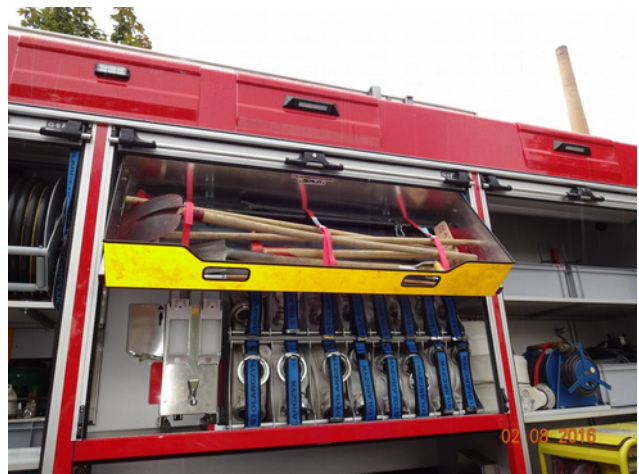
Tiltable drawers according to your wishes