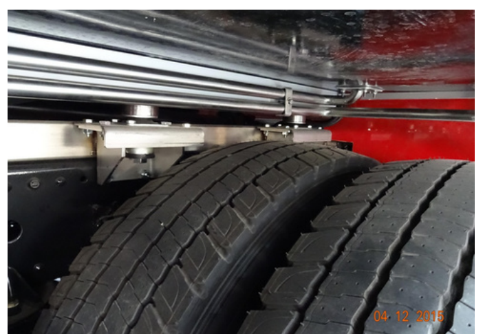
Stainless steel subframe, stainless steel water pipe