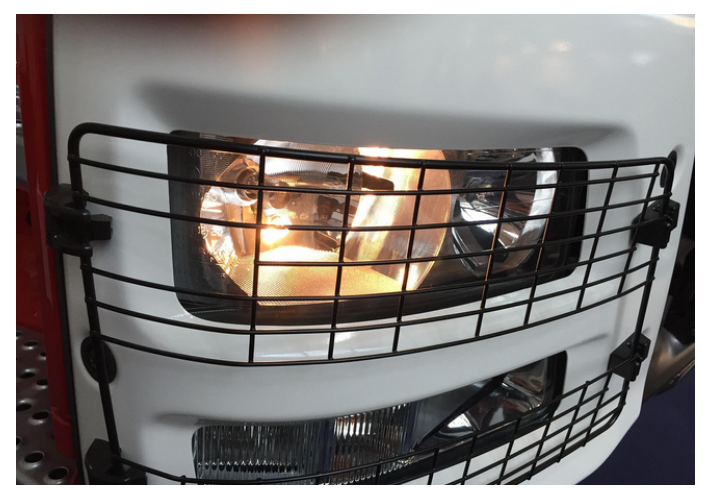
Front lighting fuse