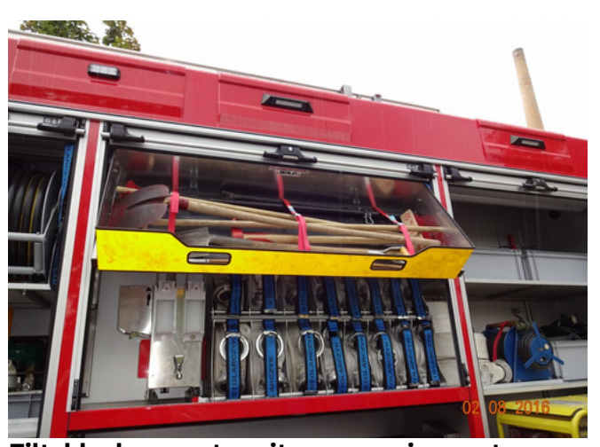
Tiltable drawers to suit your requirements