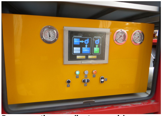
Pump operation according to your wishes