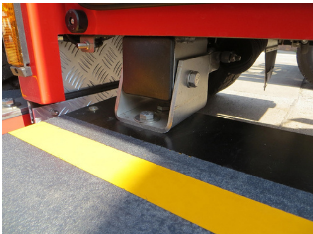
Stainless steel hinges