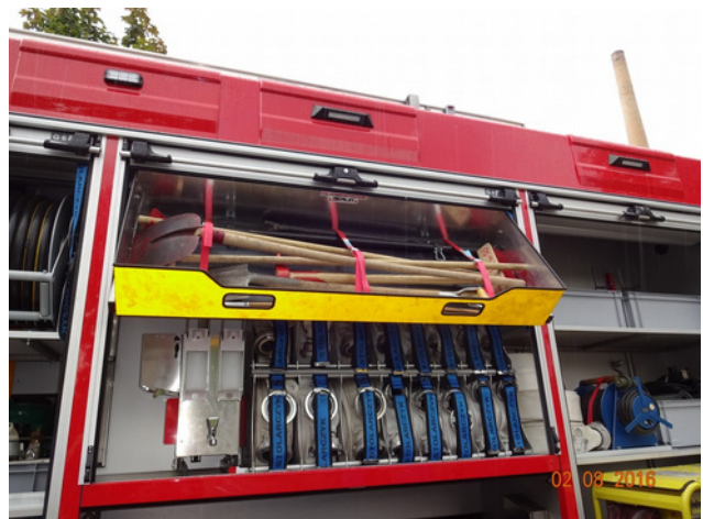
Tiltable drawers according to your wishes