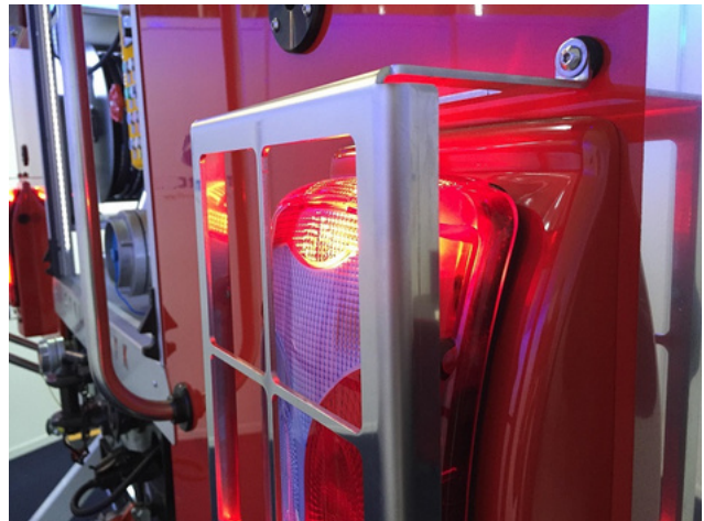
Lamps lattice protection